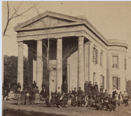
Early photo of the Beaufort College Building.

Carolina Commission on Higher Education)