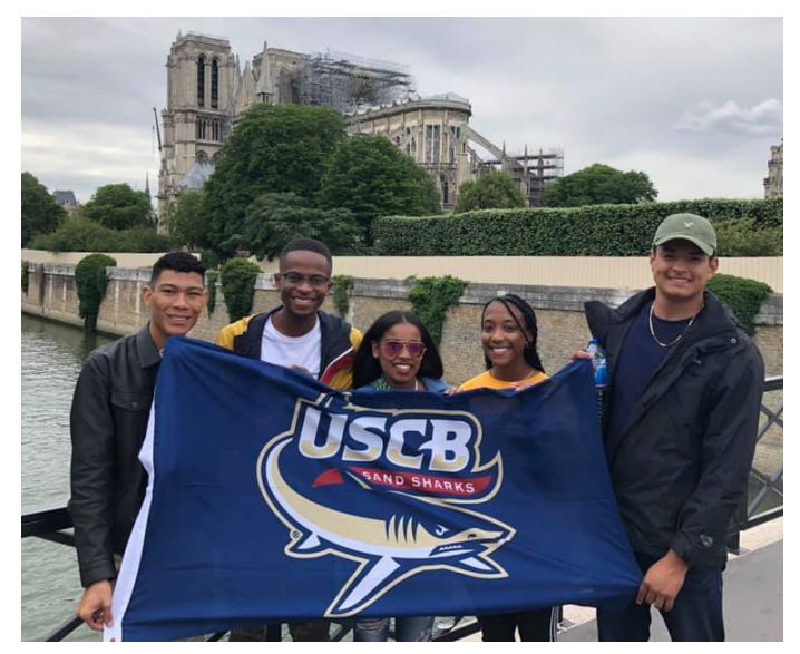
Global Studies 398 and French 201.