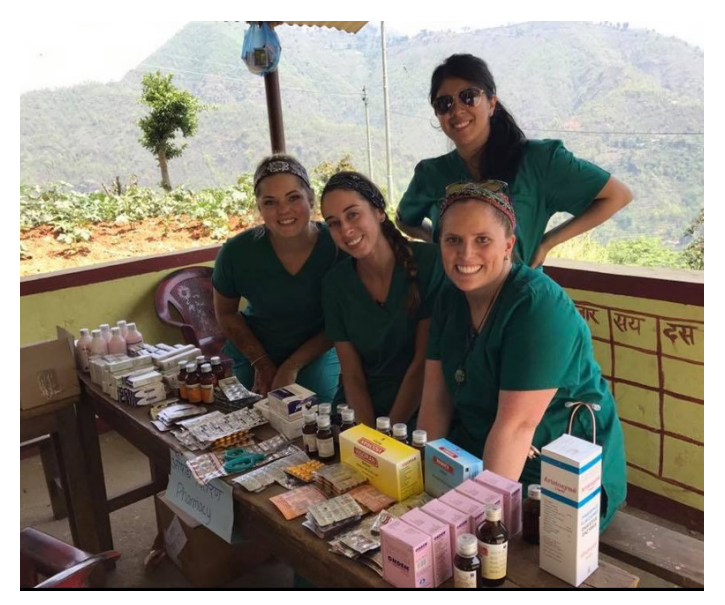
USCB students in Nepal.

23 USCB students majoring in public health and education to Helsinki and Joensuu, Finland. Their study abroad trip included visits to the University of Helsinki, Karelia University of Applied Sciences at the University of Eastern Finland Joensuu Campus, the Helsinki Sports Academy, and several local K-12 schools. The program was designed to promote critical thinking about the relationship between educational policy and health promotion in both Finland and the United States; and the participating students had the opportunity to assess how the core values, concepts and functions of public health have been applied to educational and other settings in both countries.