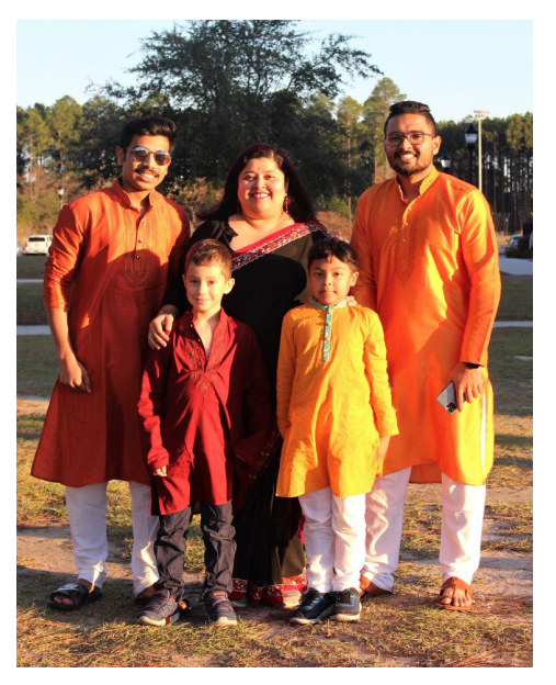
Last year's International Week.

On the last day of July 2019, a delegation of six professors from Changzhi University in China arrived on USCB's Bluffton Campus to conclude negotiations and sign a memorandum of agreement to form an institutional partnership with USCB. The group included a vice president of the