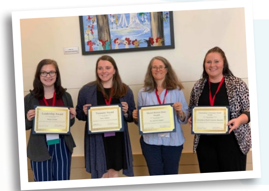
USCB-Student Nurses Association Outstanding Community Health Award at 68th Annual SNA-SC State Convention